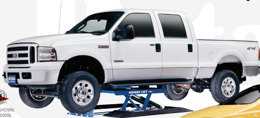
MODEL SHOWN: VLXS1000BL

7,000 - 10,000 lbs. / QUICK SERVICE LIFTS