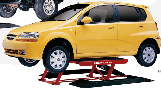
MODEL SHOWN: VLXS7000BL